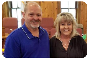
Shaping our Youth!